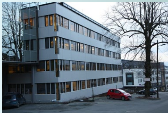
Photo: New MedViz facilities in Møllendalsbakken 7.

It is a pleasure to inform you that MedViz has moved into new facilities, rented from Department of eHealth, HUH in Møllendalsbakken 7, strategically placed within walking distance between Haukeland University Hospital and University of Bergen. We have very nice meeting rooms and all the MedViz Seminars will be arranged here. You are welcome to visit us at the 5th floor and get a free cup of coffee/tea.