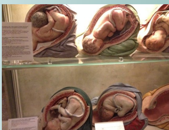
Photo: This was before the invention of ultrasound. Clay models reproducing the abdomen and uterus at term, illustrating the most important phases of expulsion of the foetal head, from mid-18th century.

• 14.03: MedViz Seminar: Physicist Ingvild Dalehaug at HUH presented “Optimization of a CT thorax-abdomen/pelvis protocol using objective methods” and MD Annette Fromm, Bergen Stroke Research Group presented “Ultrasonographic assessment of atherosclerotic carotid artery disease