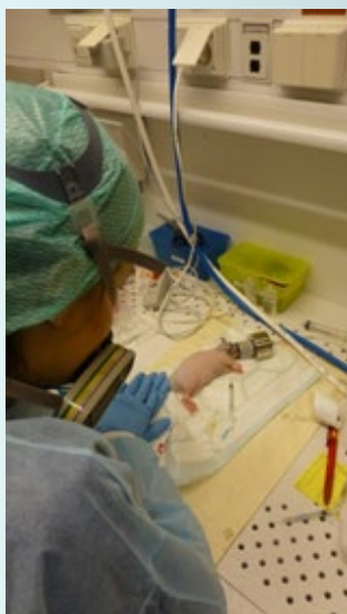
Anaesthetizing of a rat.